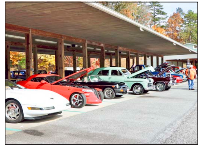
Twelve local veteran service organizations set up informational/promotional booths at the 2021 Veterans Car Show by the Blairsville Cruisers.