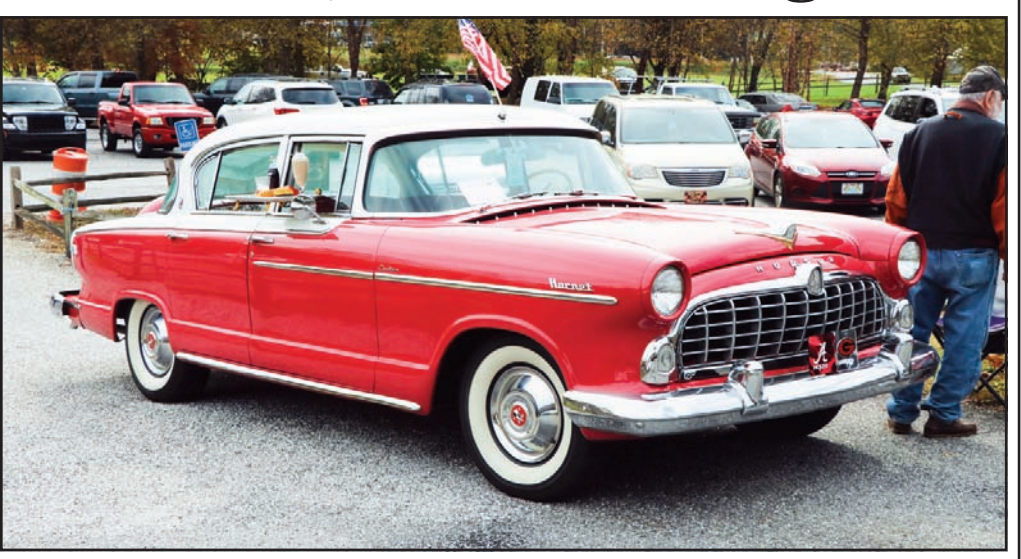
This perfectly restored 1955 Hudson Hornet brought the good old "American Diner Days" back to the Union County Farmers Market on Saturday.

Annual Salute to Veterans Car Show, Auction a huge hit